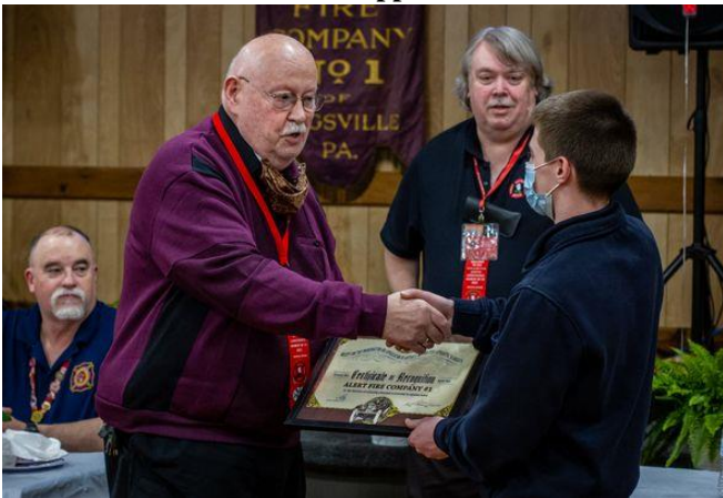
Presentation of the Restoration Award to Alert F.C.