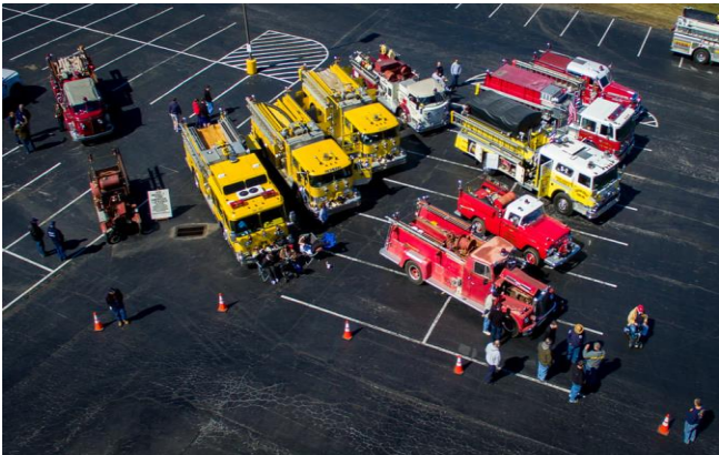
Aerial View of Apparatus

Just to let everyone know, we did make a small profit which will be distributed as the Club's members see fit. We have divided the money so we can show where it was made on a spreadsheet. How about some photos: