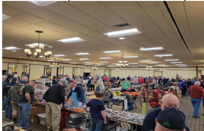
Busy Flea Market